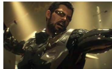
Deus Ex: Mankind Divided Deus Ex: Mankind Divided © 2017 Square Enix Ltd. All rights reserved. Developed by Eidos-Montréal.