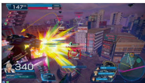
GUNSLINGER STRATOS 3

In the fiscal year ended March 2017, the Amusement Business Segment saw stable earnings, with net sales coming in at ¥42.7 billion and operating income at ¥3.6 billion. We released new arcade titles such as “GUNSLINGER STRATOS 3” and “LOVE LIVE! School Idol Festival – after school ACTIVITY –” receiving a positive response from our customers. In addition, September 2016 saw the opening of Taito Station Ikebukuro Nishiguchi, a large arcade in the busy Ikebukuro area of Tokyo featuring a jumbo screen on the exterior. Along with the “STORIA” cafe that we opened at the same time, the location has proven popular with customers as a new source of gaming experiences. In the fiscal year ending March 2018, we plan to establish a new arcade format in Hakata, the largest town in Kyushu, in collaboration with teamLab Inc., where we hope our customers will come to experience the latest evolution in arcades.