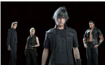
FINAL FANTASY XV ©2016 SQUARE ENIX CO., LTD. All Rights Reserved. MAIN CHARACTER DESIGN: TETSUYA NOMURA

In the fiscal year ended March 2017, the Digital Entertainment Business Segment posted net sales of ¥199 billion and operating income of ¥33.3 billion, with both figures representing year-on-year growth. In the HD (High-Definition) Games sub-segment, major titles such as “FINAL FANTASY XV,” “Rise of the Tomb Raider” for PlayStation®4, “Deus Ex: Mankind Divided,” and “NieR:Automata” made major contributions to earnings. We released “FINAL FANTASY XV,” the latest series title in the FINAL FANTASY franchise, simultaneously in all markets on November 29, 2016. Thanks to your support, the title has been a major global hit enjoyed by gamers the world over. Since the game’s launch, we have released DLC (downloadable content) and updates to ensure its many fans can continue to play it over the long term. In the case of “Rise of the Tomb Raider,” we first released versions for Xbox One and Xbox 360 followed by Windows in the fiscal year ended March 2016, before making it available for PlayStation®4 in the fiscal year ended March 2017. The global response to the title has been excellent, putting it on par with “Deus Ex: Mankind Divided” as a symbol of the high quality of our Group’s products. In addition, “NieR:Automata,” which we released in February 2017, has proven a global hit far in excess of our expectations. It has not only reminded the world of the high quality of Japanese games, but also demonstrated significant potential for future franchise development.