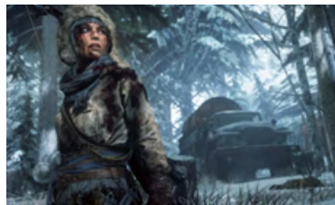
Rise of the Tomb Raider Tomb Raider ©2016 Square Enix Ltd. Published by Square Enix Co., Ltd.