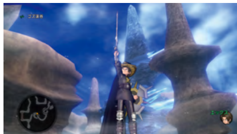
DRAGON QUEST X

© 2010 - 2017 SQUARE ENIX CO., LTD. All Rights Reserved.