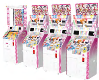
LOVE LIVE! School idol festival – after school ACTIVITY – © 2013 PROJECT Lovelive! © SQUARE ENIX CO., LTD. © KlabGames © bushiroad All Rights Reserved. “LOVE LIVE! School idol festival – after school ACTIVITY –” is joint development project with Bushiroad Inc.