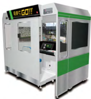
DENSHA DE GO!!

In the portion of the business dealing in amusement machine sales, we launched a newly reincarnated version of “DENSHA DE GO!!,” a train simulator game machine, as that title marked its twentieth anniversary. “DENSHA DE GO!!” is a key piece of IP (intellectual property) not only for TAITO CORPORATION but also for our Group. While the latest version has faced various challenges, it has been positively received by core fans, and we are currently exploring how we might go about further spreading its popularity. We hope you will look forward to what we have in store. In the fiscal year ending March 2019, we have launched a brand-new title, “Starwing Paradox.” Players have very high expectations for the title given the sheer size of the machine and the physical gaming experience it provides. The greatest appeal of arcade gaming is the realism it offers that cannot be gained from gaming at home. As such, we continue to see our arcades as a key piece of our Group’s gaming portfolio and intend to continue to take on new challenges in the Amusement Business Segment.