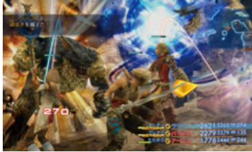
FINAL FANTASY XII: THE ZODIAC AGE

highlights its status as a title emblematic of the shift from the physical to the digital. The game was the second installment in the NieR series, coming seven years after the original. New players also loved it, and we feel that we have succeeded at establishing a new franchise for our Group.