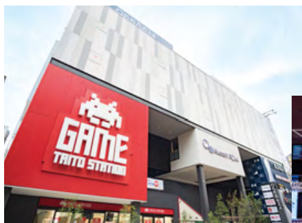
MEGARAGE at the Taito Station arcade in Mizonokuchi

©TAITO CORPORATION 1996, 2018 ALL RIGHTS RESERVED. JR東日本商品化許諾済