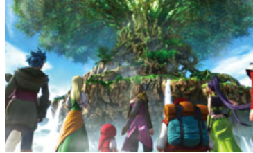
DRAGON QUEST XI: Echoes of an Elusive Age

©2006, 2017 SQUARE ENIX CO., LTD. All Rights Reserved.