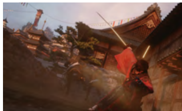
FINAL FANTASY XIV

In the MMO (Massively Multiplayer Online game) sub-segment , we launched expansion packs for both “FINAL FANTASY XIV” and “DRAGON QUEST X” for the first time in two years in an endeavor to maintain and expand our paying subscriber base. Continuously adding new content is key to maintaining paying subscribers for online games, which tend to show marked attrition with the passage of time. The release of the expansion pack proved especially effective for “FINAL FANTASY XIV,” which, in defiance of the aforementioned tendency, achieved the highest paying subscriber count since its launch. The game itself has also garnered extremely positive feedback, and we saw the year as one in which it demonstrated its presence as a global MMORPG. Having been on the market for more than five years, both titles are long runners, but by rolling out new content on an ongoing basis, we will endeavor to create an even more robust service.