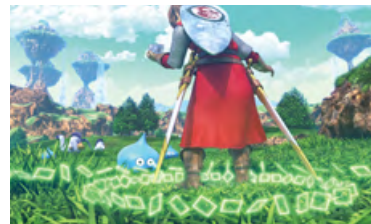
DRAGON QUEST X ONLINE

© 2010 - 2018 SQUARE ENIX CO., LTD. All Rights Reserved.